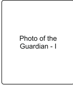
Photo of the Guardian - I

I _____ Father/Mother/Guardian of _____ (Name of the student) authorise the following persons as guardian and one local guardian of my ward. Any of them may visit or take my ward out of School.